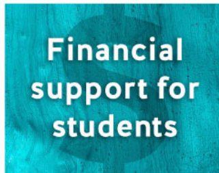
FINANCIAL SUPPORT FOR STUDENTS