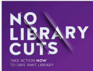
RUSU SAYS NO TO LIBRARY CUTS