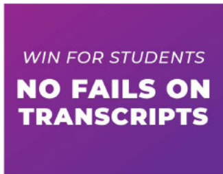
NO FAILS ON TRANSCRIPTS