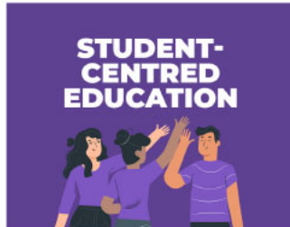
HAVE YOUR SAY DAY 2020 – ALL YOUR IDEAS & WHAT NEXT?