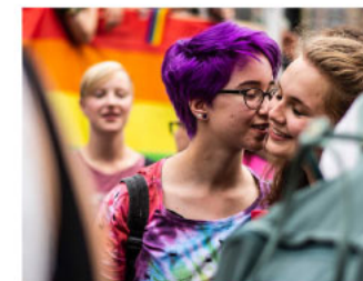
FREEDOM FROM DISCRIMINATION