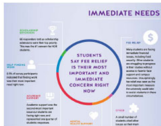
COVID-19 SURVEY SNAPSHOT