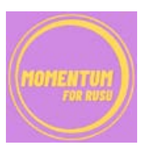
No statement submitted.